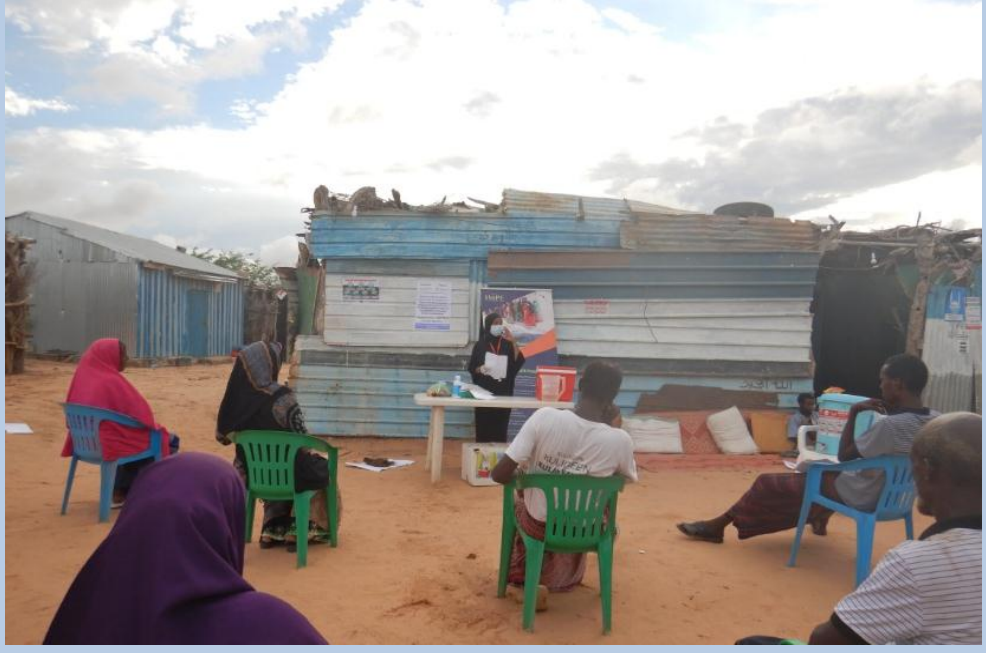
During an interactive practical session on how to properly wash hands